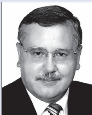
Anatoliy GRYTSENKO, Chairman of the National Security and Defence Committee of the Verkhovna Rada of Ukraine