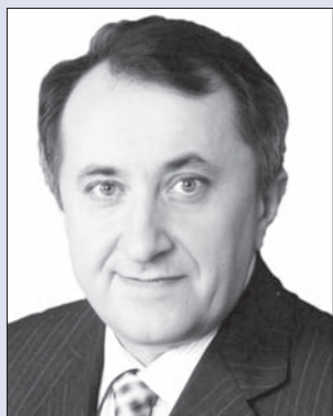
Bohdan DANYLYSHYN, Minister of Economy of Ukraine