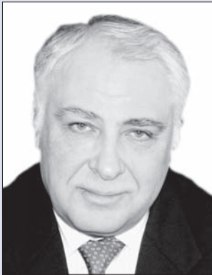
Yuriy KOSTENKO, First Deputy Minister for Foreign Affairs of Ukraine