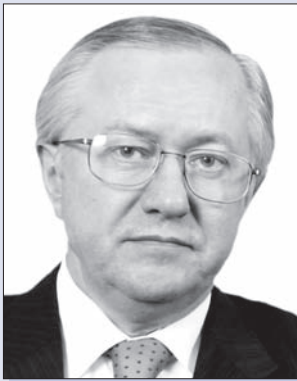
Borys TARASYUK, Chairman of the Committee on European integration of the Verkhovna Rada of Ukraine

– How would you assess the present state of Ukraine-Russia relations? What are the reasons for the crisis in partnership between the countries, threatening effective development of cooperation?